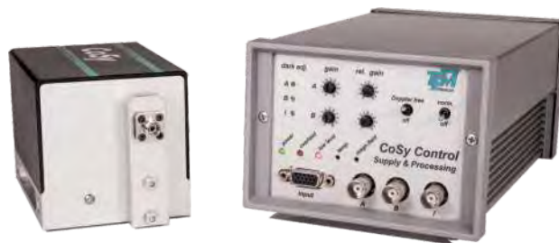
CoSy measurement head and CoSyControl electronics

The method of saturation spectroscopy allows to represent a wavelength with extremely high precision, e.g., for absolute stabilization of tunable lasers. Light from a tunable laser is led into a glass cell filled with a suitable gas, the particles of which absorb light of particular wavelengths. By the technique of Doppler-free saturation spectroscopy, a suitable optical setup consisting of several part beams compensates for the Doppler broadening of atomic lines to a large extent, which highly increases the resolution of the measured absorption lines.