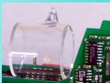
alkali spectroscopy cell