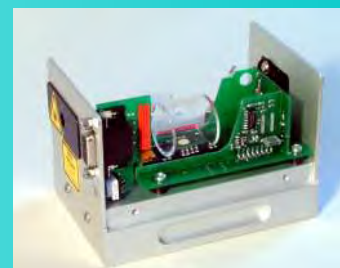
CoSy head from the inside