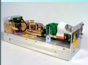
CoSy integrated into DL 100

The complete opto-mechanical setup, consisting of beamsplitters, mirrors, detectors, and the spectroscopy glass cell, is integrated in the CoSy measurement head. As the degree of absorption depends on the vapor pressure of the chemical element in the glass cell and therefore on its temperature, the CoSy head is equipped with a regulated cell heating.